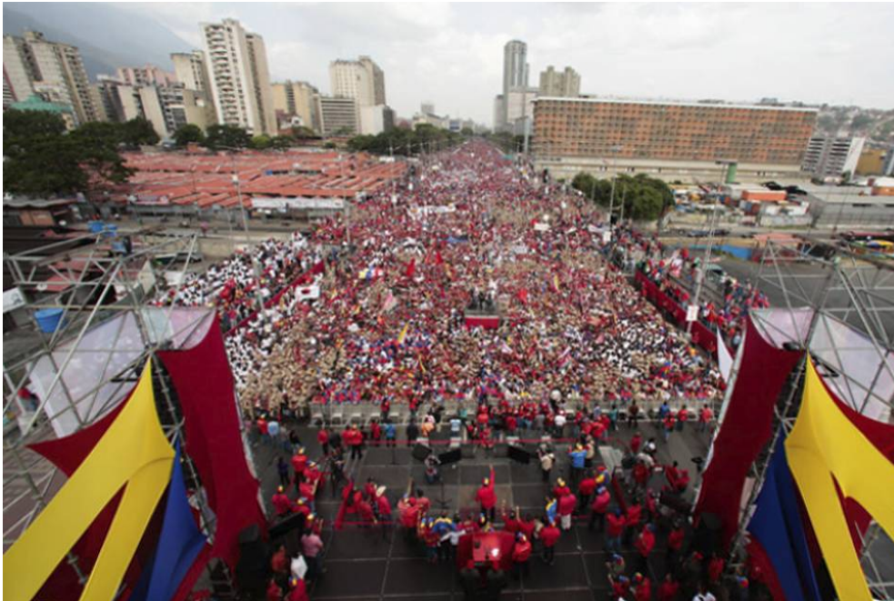
Masses pour out in support of Venezuelan government.

By Teresa Gutierrez posted on April 24, 2017