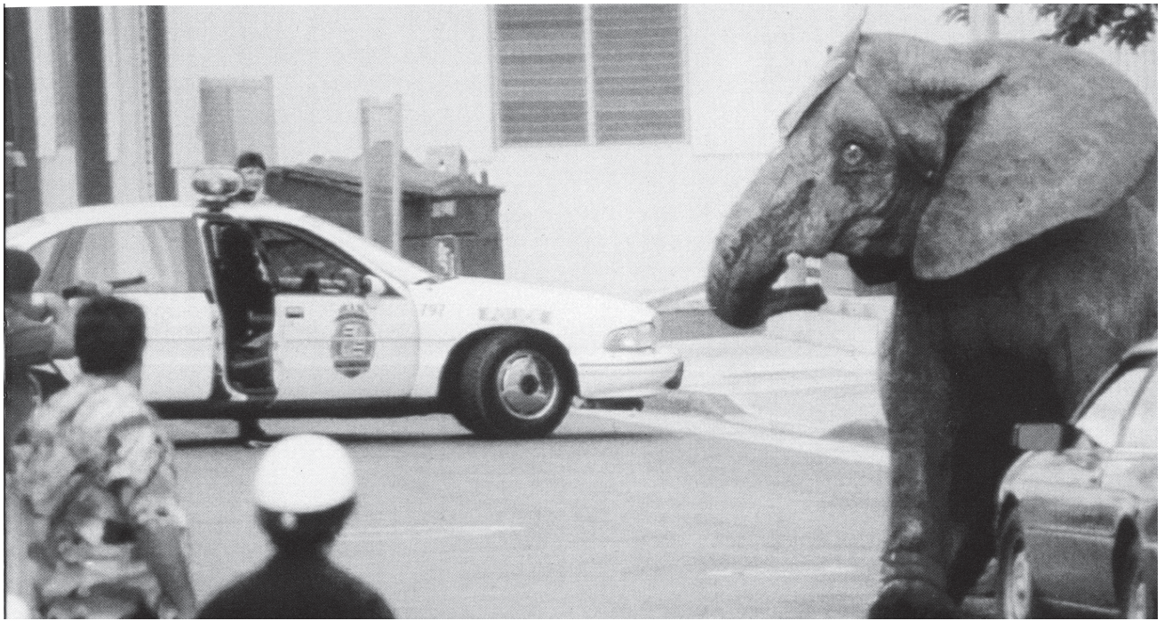
TYKE, AN ELEPHANT WHO WENT ON A RAMPAGE IN HONOLULU, WAS KILLED IN A GUNFIRE AFTER KILLING HER TRAINER AND INJURING DOZENS OF SPECTATORS

Finally, in indigenous traditions, ceremonies precede the killing of animals; participants recognize their kinship with animals and ask forgiveness for taking their life, noting that it was only so that the people could live. No part of an animal is wasted, and ethical teachings consistently remind people that killing or harming animals wantonly is an act of